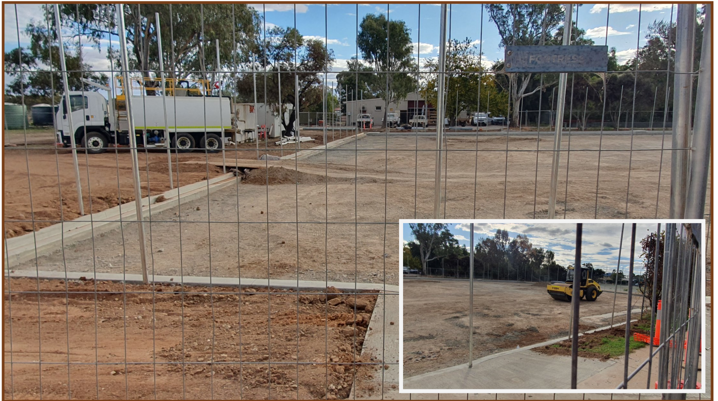
Science Demolition area is receiving the topsoil to finish this site off.

Basketball Courts are ready for the last 2 stages of the surface and should be complete by the start of May. Then final fit out of fencing/rings and lines will be completed. Hopefully by the end of May we will have the courts fully functional.