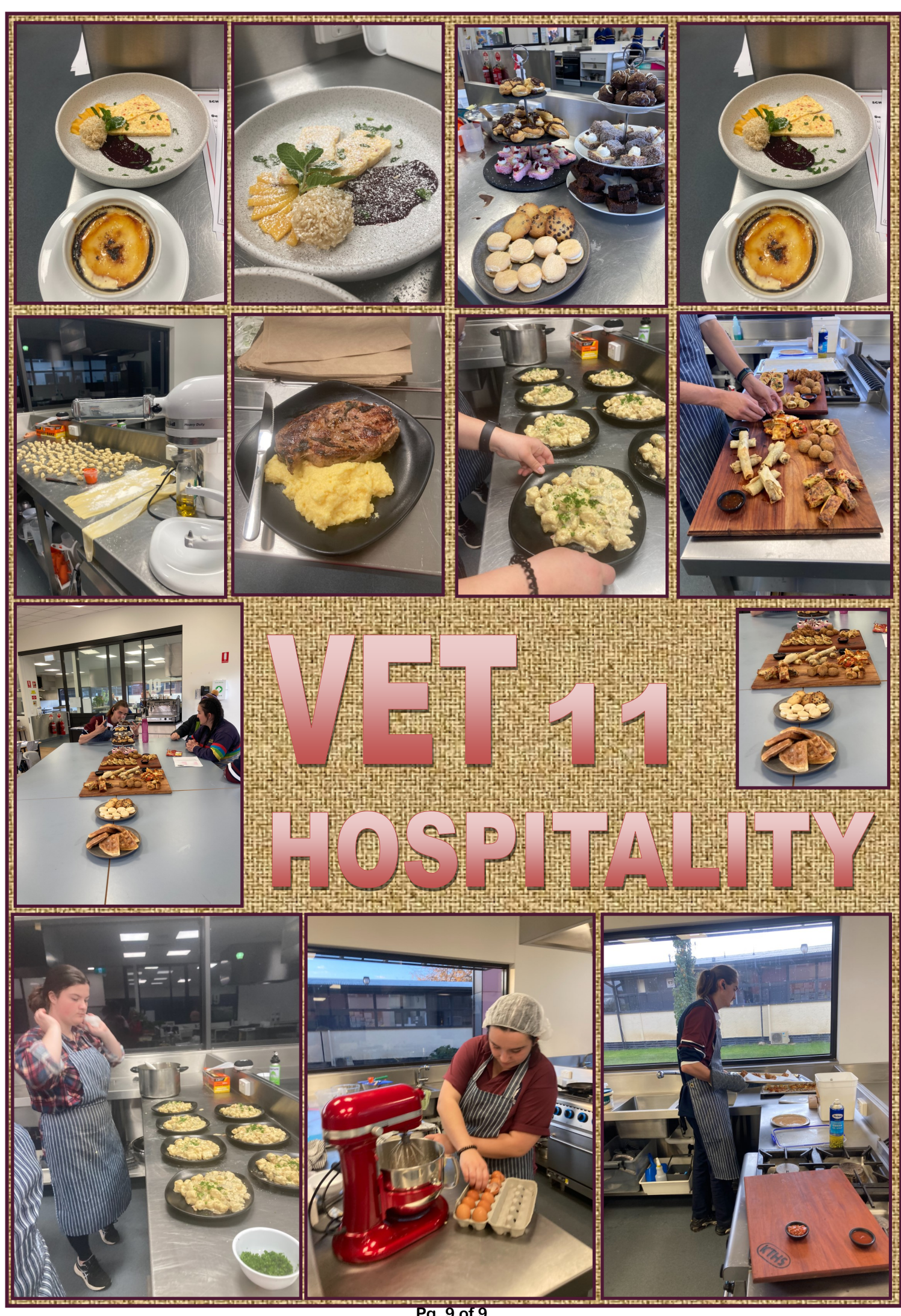
Pg. 9 of 9