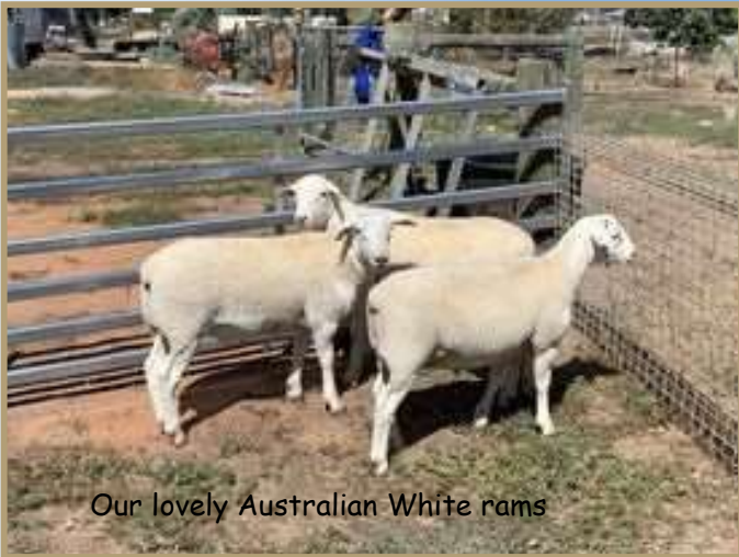
Our lovely Australian White rams